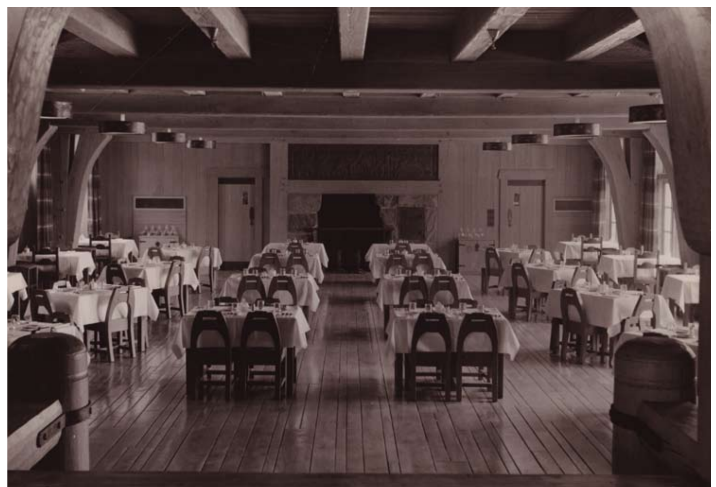
Timberline Lodge, Dining Room, Mt. Hood, Oregon

The Craft Connection hile some craft artists find working hand-in-hand with others challenging, for some it is both a necessity and a pleasure. The artists at Pilchuck School of Glass and the quilters at Mississippi Cultural Crossroads could work alone if they wished; however, both prefer to work in collaboration with others. What is it about the act of collaboration that appeals to these artists? They know that by working hand in hand with others they can create beautiful handcrafted objects that realize a common goal and reflect a shared vision, imbued with a spirit of collaboration. Craft artists who work with others truly understand the benefits of collaboration.