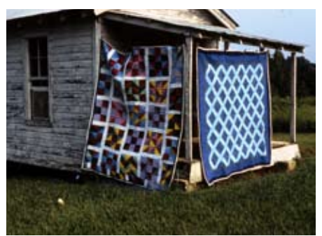
Quilts Hanging, Port Gibson, MS.

Mississippi Cultural Crossroads Founded in 1978, Port Gibson, Mississippi